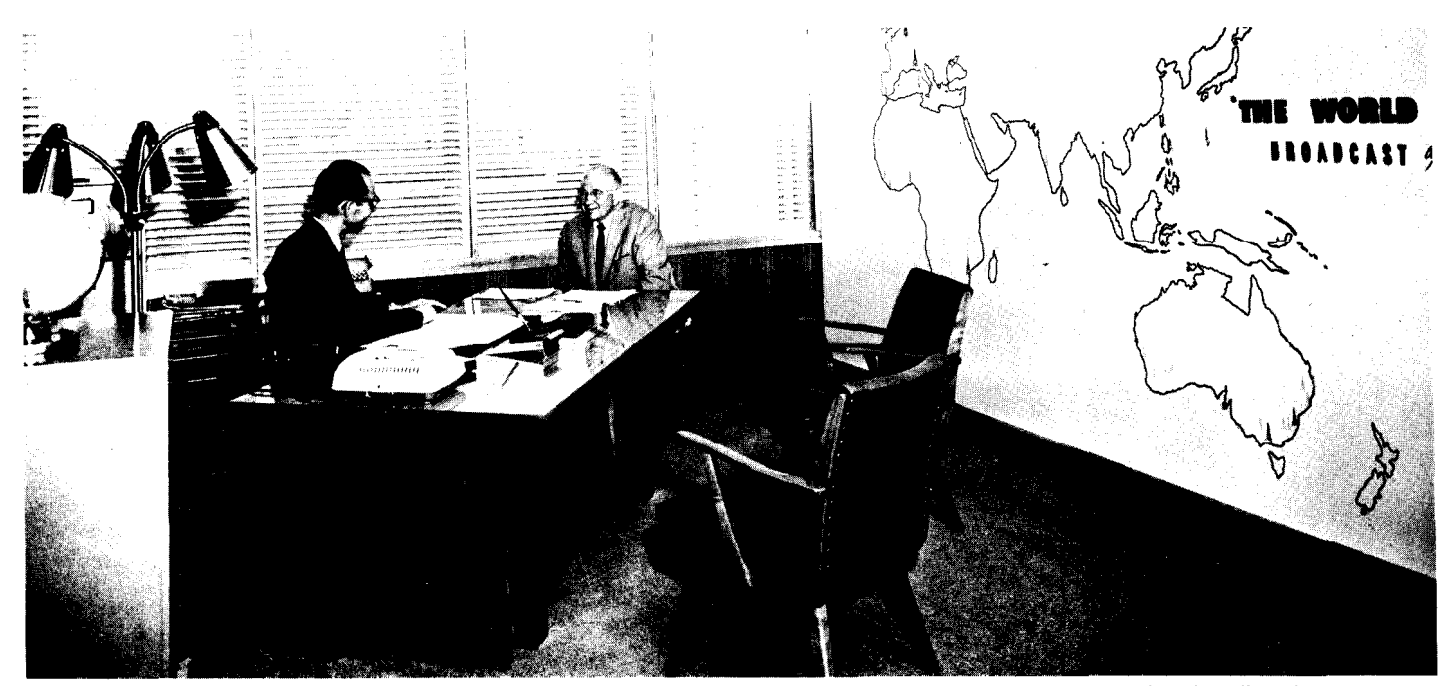
Ambassador College Photos